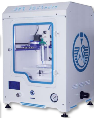
3DPL BioPrinter N2 Dual extruder heads